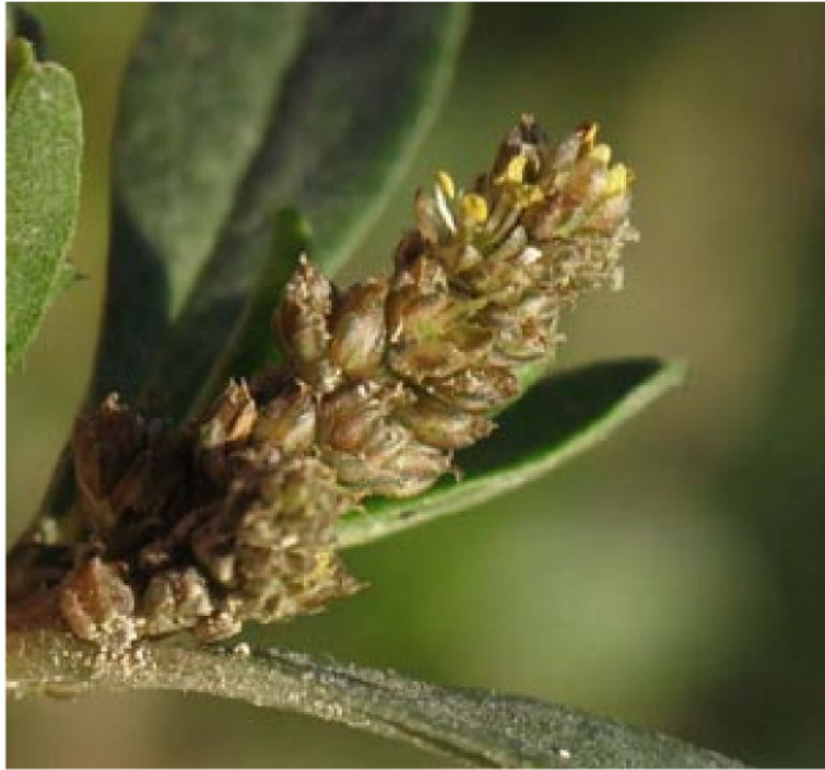
Figure 7: Flowering spike of Amaranthus muricatus (Gillies ex Moq.) Hieron. – new taxon for the Maltese Islands.