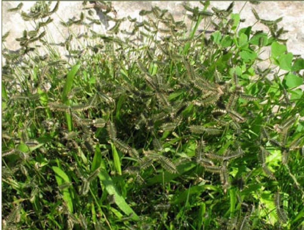
Figure 5: Dactyloctenium aegyptium (L.) Beauv. – new taxon for the Maltese Islands.