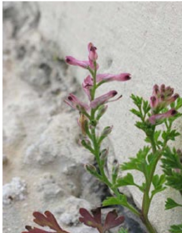
Figure 8: Fumaria reuteri Boiss. - new taxon from the Maltese Islands.