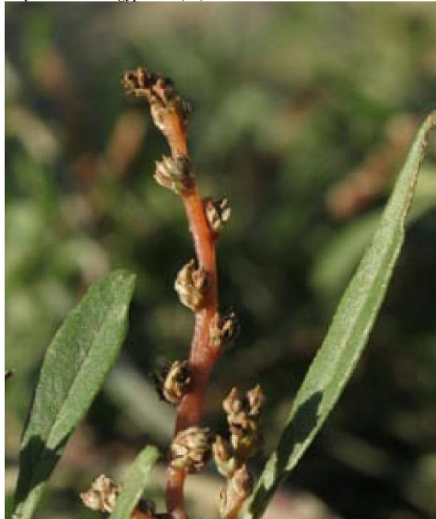
Figure 6: Fruit of Amaranthus muricatus (Gillies ex Moq.) Hieron. – new taxon for the Maltese Islands.