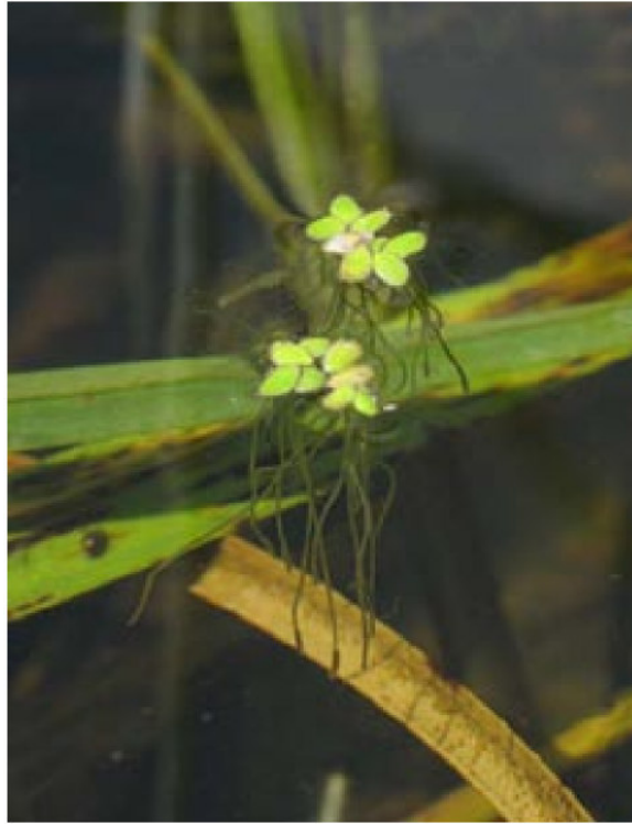
Figure 9: Spirodela oligorrhiza (Kurz) Hegelm. - new taxon from the Maltese Islands