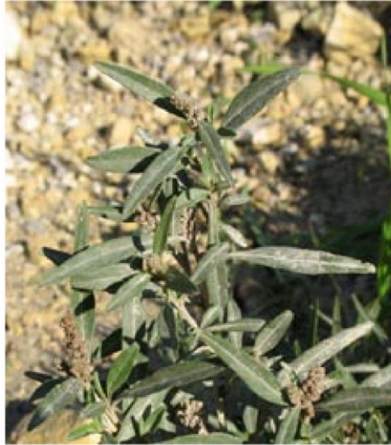
Figure 2: Amaranthus muricatus (Gillies ex Moq.) Hieron on disturbed ground at Mriehel, Malta

Few specimens of Amaranthus muricatus (Gillies ex Moq.) Hieron were found in Malta in November 2007 lying on disturbed ground at the Industrial Estate of Mriehel. The area was surrounded by ruderal species, the most abundant of which being Diploaxis tenuifolia (L.) DC, Foeniculum vulgare L., Dittrichia viscosa (L.) Greuter and some specimens of Ecballium elaterium (L.) A. Richard and Piptatherum miliaceum (L.) Cosson. Plants exhibited themselves as a low mat of about 1 metre across consisting of dark green leaves, giving the first impression of a population of many plantlets, but close examination revealed a couple of large, highly-branched, procumbent plants. Two smaller populations of this herbaceous, short-living, perennial species were found at the same locality in May 2008; one growing on disturbed ground some 40m away from the population found in November, and another about 200m away, also on disturbed ground in an abandoned field, along other ruderal species. On the 3 rd of October 2008, the site was revisited, and one of the smaller populations was not found (the site was cleared), while the other two had increased significantly in size. For instance, the population found in November 2007 had increased markedly and its area of occupancy was more than 2m across.