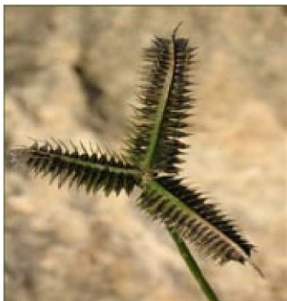
Figure 1: Dactyloctenium aegyptium (L.) Beauv. from Wied tax-Xlendi, Gozo, Malta

Dactyloctenium aegyptium (L.) P. Beauv. (= Cynosurus aegypticus L.) is a caespitose plant with geniculately ascending, or decumbent culms. The lamina of the slender leaves is glabrous, but the margin and ligule are conspicuously ciliate. It is easy to identify from its characteristic digitate inflorescences, hence the English name "crowfoot". It normally forms 3-6 spikes (racemes) spreading and radiating out from the top of the culm and hence forming a digitate arrangement. The 12-65 mm long, oblong-shaped racemes are composed of 2 rows of spikelets, perpendicular to and at each side of the common rachis. Each spikelet comprise 3 to 4 fertile florets about 3mm long each producing a set of 3 white anthers, less than 1mm long. The fruit is obovoid, rugose, 1mm in size and with a soft pericarp.