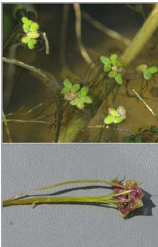
Figure 4: Spirodela oligorrhiza (Kurz) Hegelm. with 2-4 roots per frond and a mauve underside.

Spirodela oligorrhiza is an aquatic plant found in many southern states of North America; South America; Asia, Africa, Atlantic Islands; Pacific Islands and Australia (FNA, 2004). Tutin et al. (1980) adds horticultural gardens of Calcutta, India but does not give any reference to European stations. Distribution in Europe seems to be restricted to Italy and is given by Pignatti (1982) as a new species (“ic nova”) in the region of Lombardy. The same and only Italian region was also given for S. oligorrhiza some decades later by Conti (2005). From the distribution given above, Spirodela oligorrhiza is likely to be an alien species in the Maltese Islands and possibly the rest of Europe. If this is the case, the source of introduction in the Maltese islands remains unclear for this species, but Lemnaceae species are often sought by aquarium hobbyists.